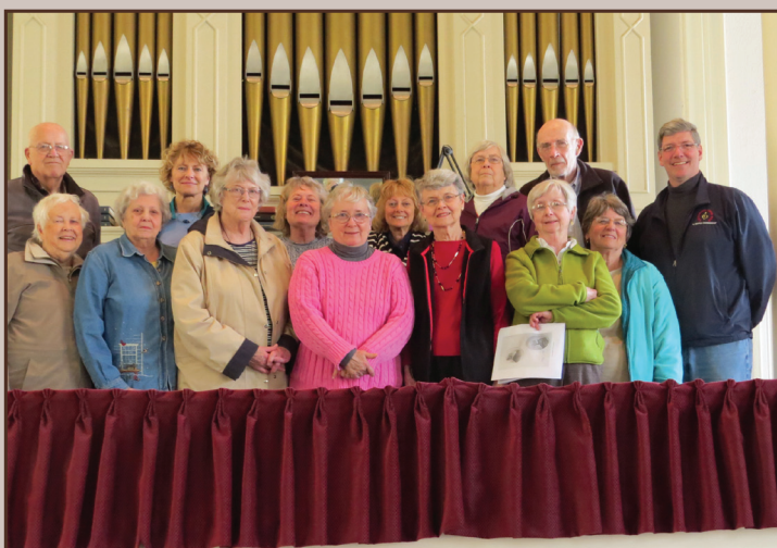
Penobscot Valley Senior College Field Trip to Elm Street Congregational Church in Bucksport. E. & G. G. Hook, Opus 328 (1863).