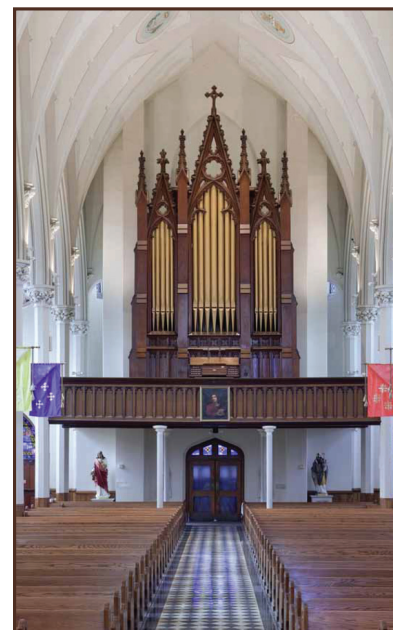
E. & G. G. Hook, Opus 288 (1860)

ST. JOHN'S CATHOLIC CHURCH | 207 YORK STREET, BANGOR, MAINE 04401 | WWW.HOOKOPUS288.ORG