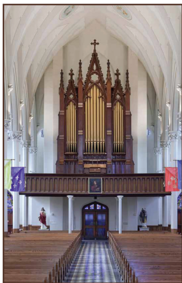
E. & G. G. Hook, Opus 288 (1860)

ST. JOHN'S CATHOLIC CHURCH | 207 YORK STREET, BANGOR, MAINE 04401 | WWW.HOOKOPUS288.NET