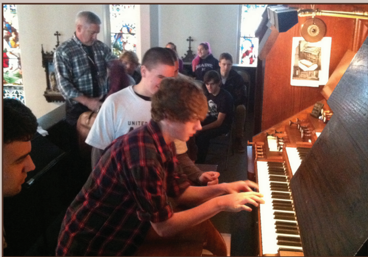
Students from Bangor High School experience Opus 288 first hand!