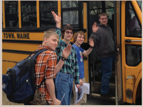
Students from Bangor High School