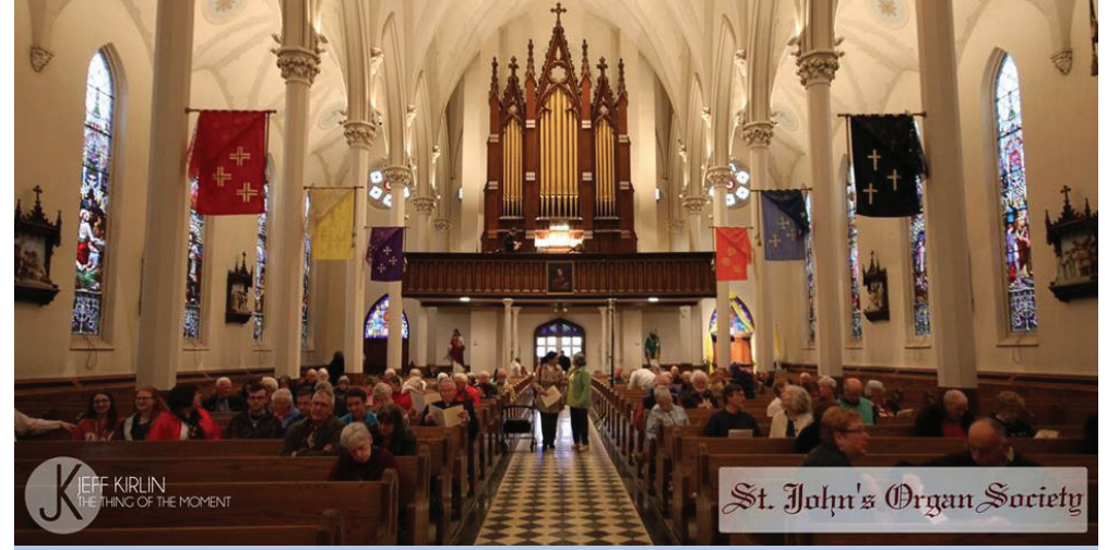
You can find the St. John's Organ Society on Facebook! Stay on top of all that's going on with the Hook Opus 288, concerts, and more by searching and liking HOOKOPUS288 or St. John's Organ Society.