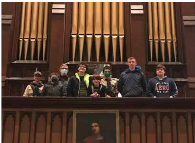
Scout Troop 61, Dover-Foxcroft, visited the E. & G. G. Hook Organ in the fall of 2021.

ST. JOHN'S ORGAN SOCIETY WWW.HOOKOPUS288.ORG