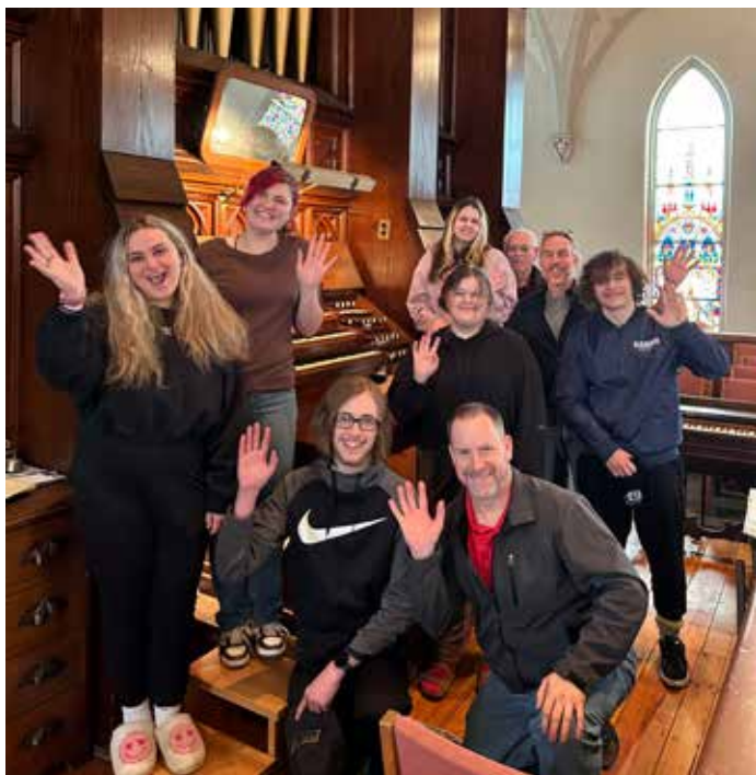
Visitors from Orono High School - March 14, 2024